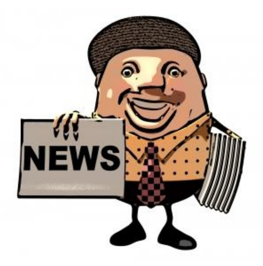
Using Banner Ads For Traffic

All types of advertising is beneficial to online and offline businesses. However choosing the type of advertising that is most suitable would give it the edge the campaign needs to take it to the next level. Banner ads will do that.