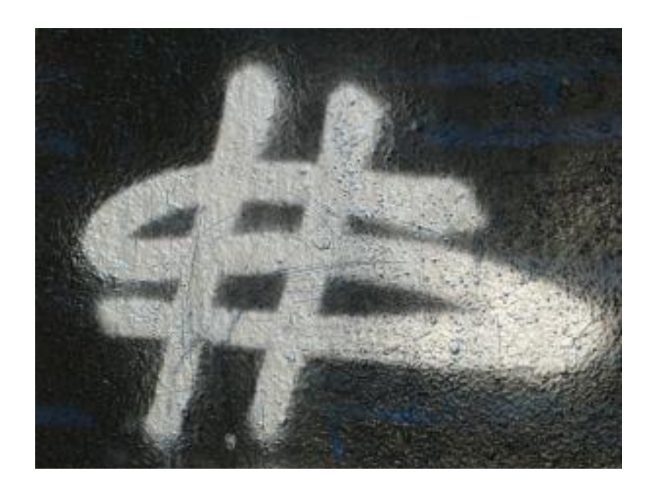
Crafty Cash Turn Your Arts And Crafts Skills Into Cash

All types of leisure activities can be turned into a viable business should the individual decide to make it an income earning venture. With this in mind, anyone wanting to venture into the business field should be well equipped with the various connecting dos and don'ts of doing business. Get all the info you need here.